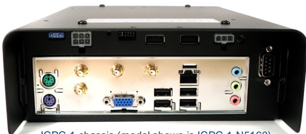
ICPC-1 chassis (model shown is ICPC-1-N5160)