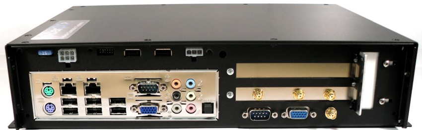
ICPC-4 chassis (model shown is ICPC-4-C2266)