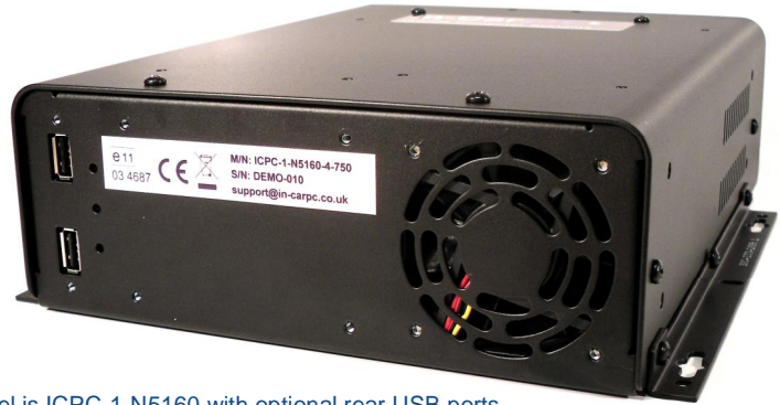
Pictured model is ICPC-1-N5160 with optional rear USB ports