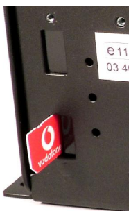
Integrated 3G options