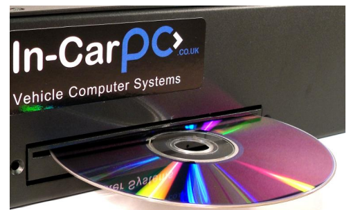
Internal optical drive or removable hard drive options