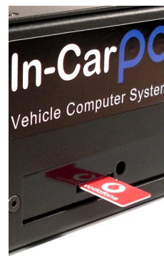
Pictured model is ICPC-4-C2266 with optional internal slot-loading DVD-RW drive. Optional removable hard drive or externally accessible SIM slot for internal 3G module available (shown right) in place of optical drive.